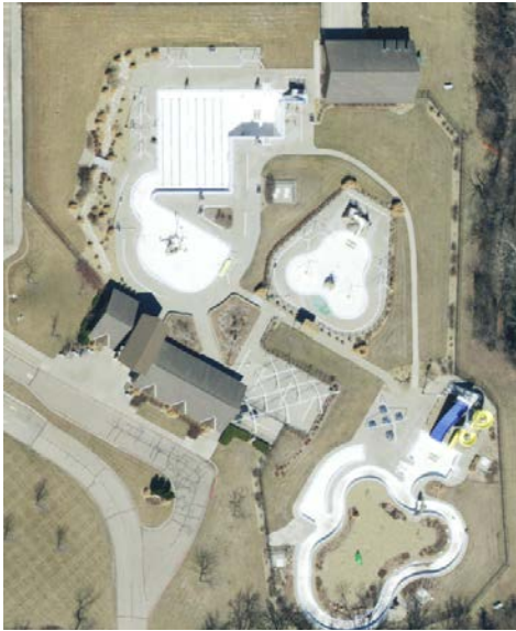
Shawnee North Family Aquatic Center