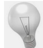
No Light Bulbs are acceptable

Household Hazardous Waste such as Paint, Batteries, Herbicides and Pesticides can be taken to the Facility located at 131 NE 46th St.