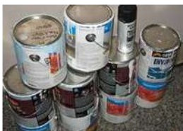
Left Over Paint

Household Hazardous Waste such as Paint, Batteries, Herbicides and Pesticides can be taken to the Facility located at 131 NE 46th St.