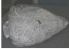
Shredded Paper Place in Clear Plastic Bags