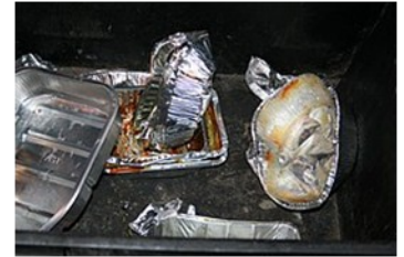
Food Contaminated Aluminum Foil