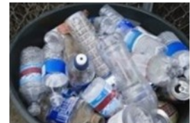
Plastic Water Bottles

Be sure to remove lids and rinse all containers and break down cardboard boxes before placing in the cart.