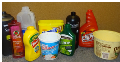
Plastic Bottles & Tubs