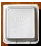
No Styrofoam of any Kind