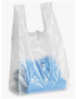
Plastic Grocery Bags