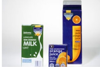
Wax Coated Milk Cartons and Juice Boxes