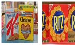
Cereal & Cracker Boxes