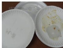
No Paper Plates